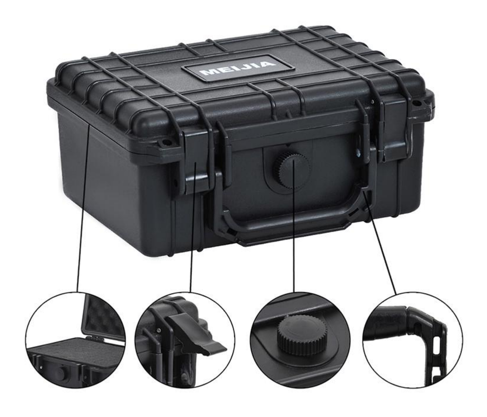
Easy To Open With Latches Design Smarter and easier to open than traditional cases. Start the release and offers plenty of leverage to open with a light pull in just seconds.